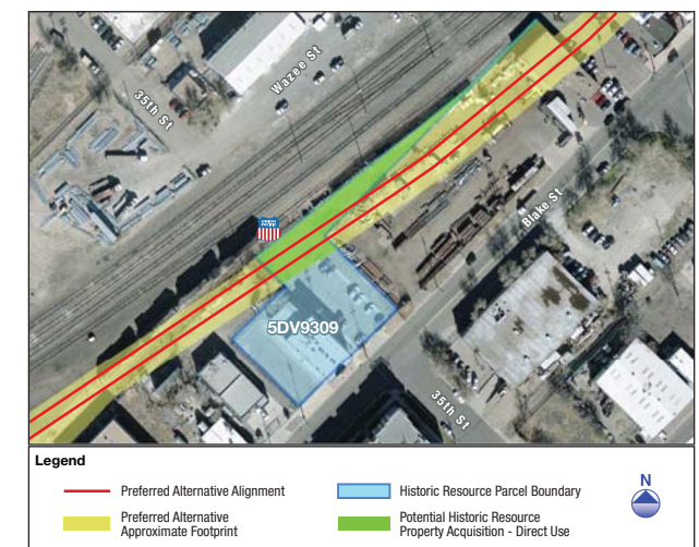
Freedom Cab Company (5DV9501)

The Preferred Alternative alignment would cross through the northern edge into the parking area of the property as it approaches the 38th/Blake station. The Preferred Alternative would require a potential partial acquisition of approximately 0.22 acres of the property, resulting in an adverse effect.